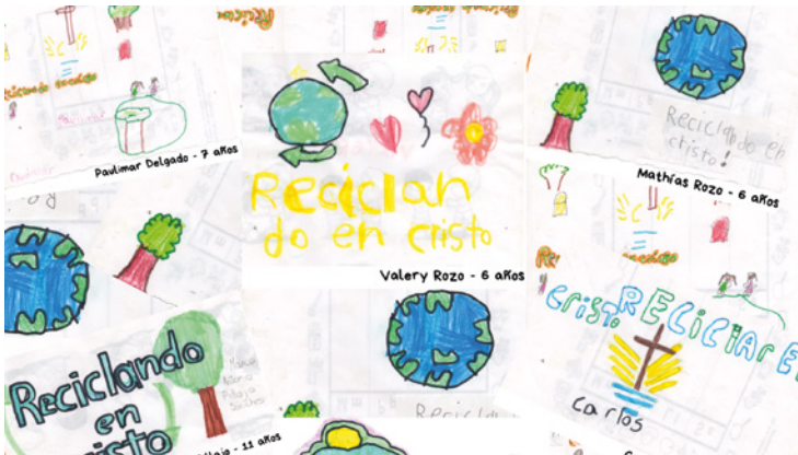
The Sunday School children designed logos for the recycling project