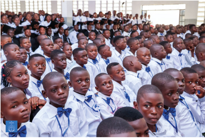
Some 15,000 brothers and sisters attended the divine service