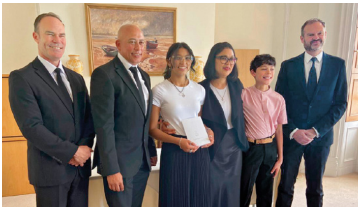
Confirmation in the congregation