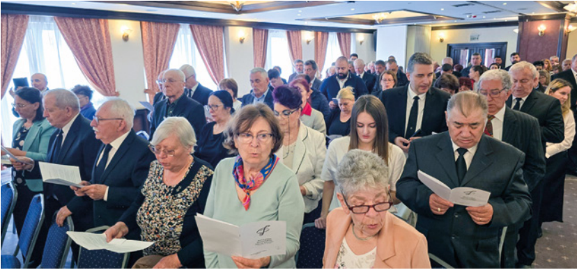
The congregation in Sighisoara, Romania, on 11 May 2025

“Why does God want to do so much good for me? I can’t possibly earn this!”