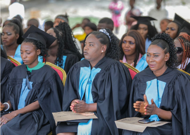
Graduates of the Chabota Vocational Training Centre