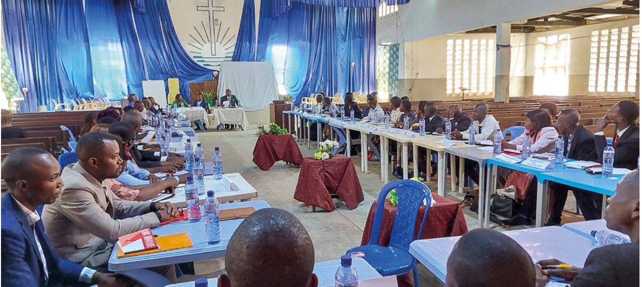
NAC DR Congo South-East

An educational initiative by the New Apostolic Church provides training for teachers in the Democratic Republic of the Congo