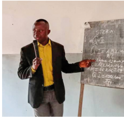
Sunday School teachers and one of the instructors during a lecture

phase is still to come, which will then effectively involve and cover all congregations in the south-eastern part of the DR Congo. This will be the final phase of the training programme. The long-term objective is clearly defined: to