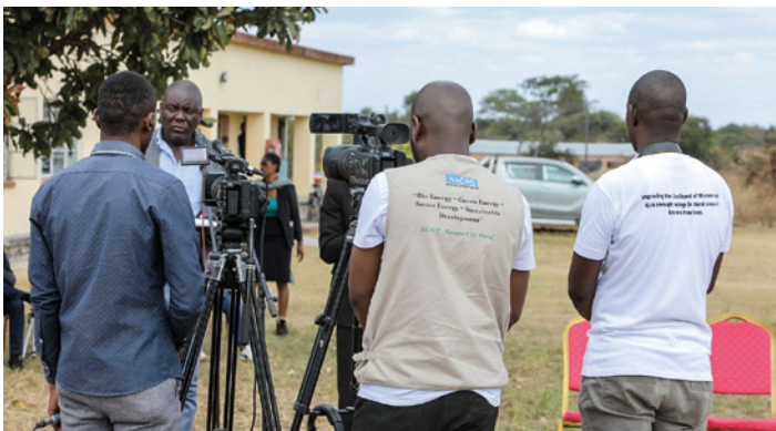
The press reports on the event

On 4 July, 73 young people received their diplomas after completing a one-year course in general agriculture at the Chabota Vocational Skills Training Centre, which is run by the New Apostolic Church Relief Organisation (NACRO). The programme aims to equip vulnerable young people with practical skills for a sustainable livelihood and improved food security.