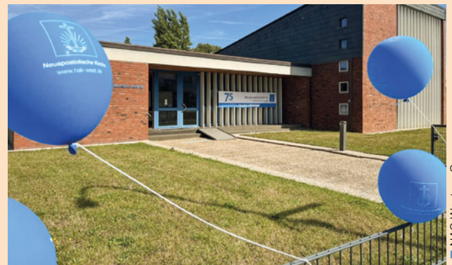
NAC Western Germany

The anniversary service commemorated this new beginning, the New Apostolic Church of Western Germany reports. A new Bible was placed on the altar: a gift from the district youth. The previous Bible had been destroyed in the flood.