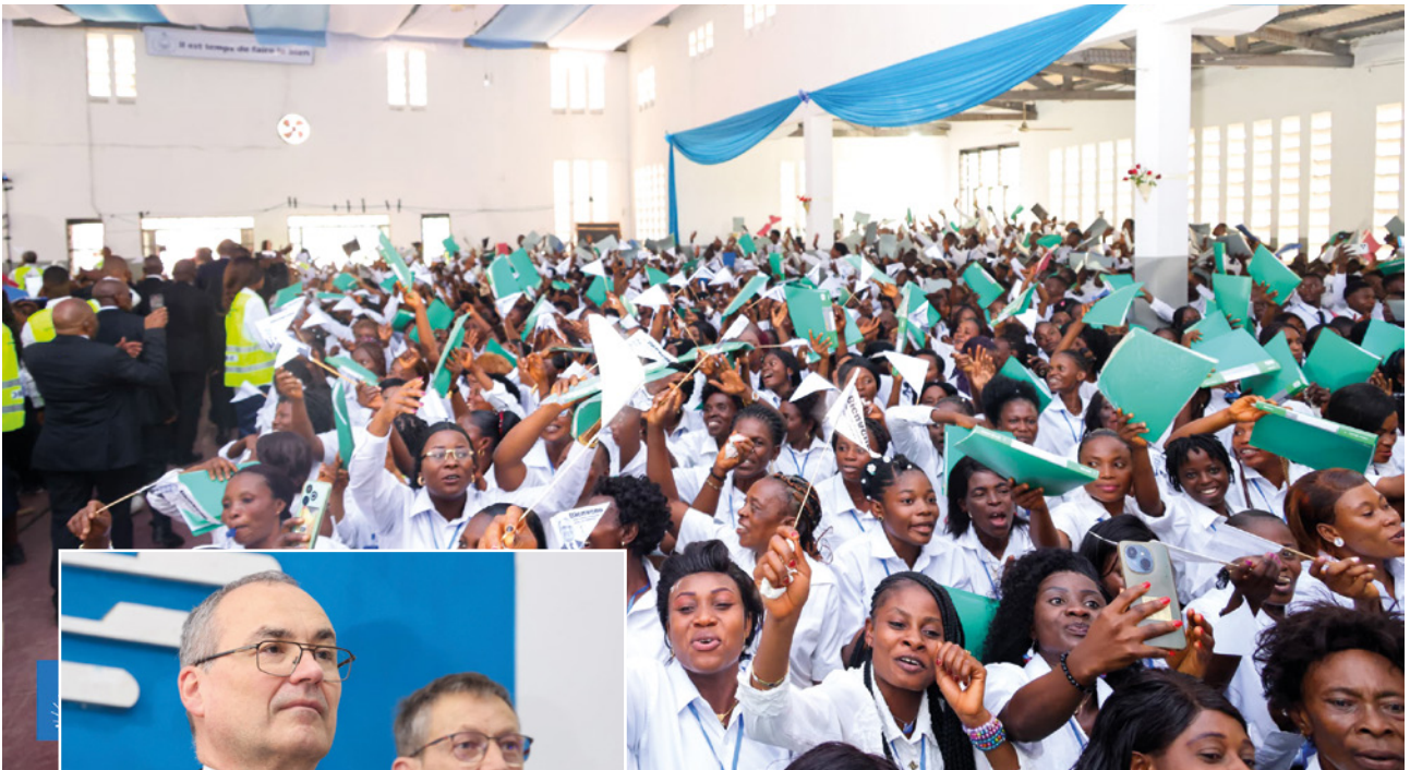
NAC DRC South-East