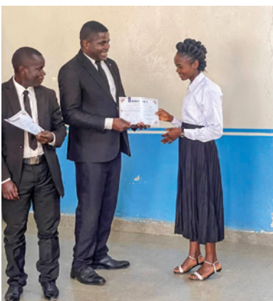
Certificates are being presented following the successful completion of the teacher training programme