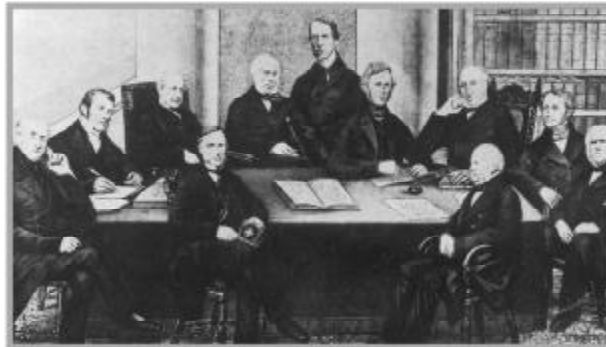
The first Apostles of the end-time