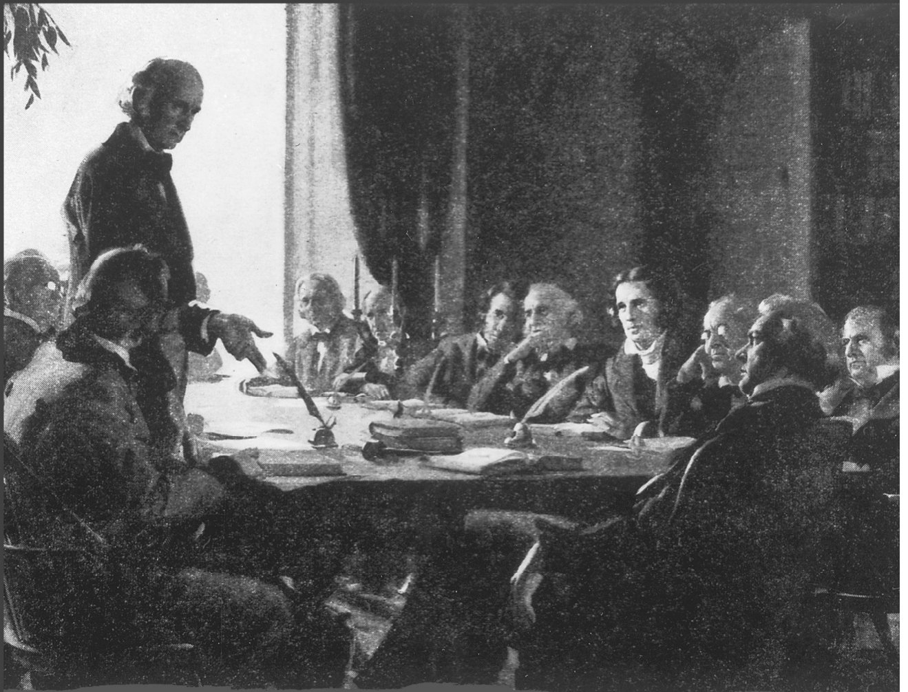
THE ALBURY CIRCLE