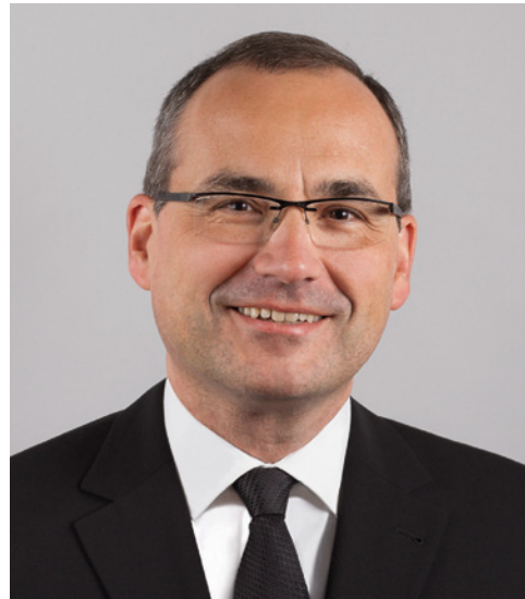
New Apostolic Church International

Jesus promised, if you gather together in My name and ask in My name, you will receive. Whenever we come together to pray in Jesus' name, He is among us and prays with us.