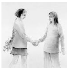
And forgive us our debts, as we forgive our debtors.

And forgive us our debts, as we forgive our debtors