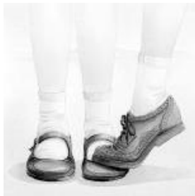
And lead us not into temptation, but deliver us from evil.

And lead us not into temptation, but deliver us from evil