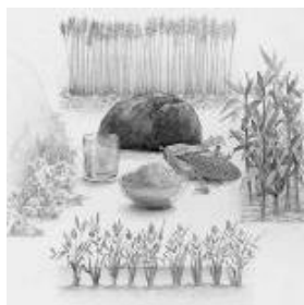
Give us this day our daily bread.