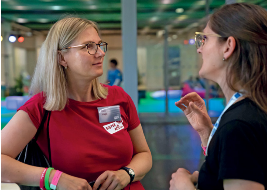
The sisters at the booth discovered that 93 per cent of the members would like sisters appointed to pastoral care in their congregation

This opinion poll was part of the concept behind a 900-square-metre exhibition and discussion area focused on the matter of pastoral care. The offer was organised by a project group comprised of New Apostolic women from all the Regional Churches of Germany, Switzerland, and France. The team members were appointed by their respective Apostles. The survey was intended to explore what pastoral care means to young people and which communication channels they would prefer for pastoral care discussions.