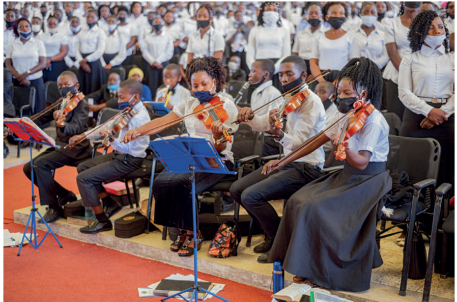
A choir and a string ensemble created a beautiful atmosphere