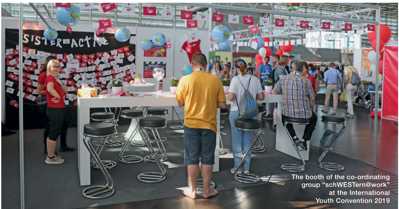
The booth of the co-ordinating group “schWESTern@work” at the International Youth Convention 2019

This coordinating group is not only the point of contact for all topics relating to women and girls. It also provides information on tasks and services that women perform in the New Apostolic Church. This includes, for example, an extensive survey that was conducted during the International Youth Convention 2019.