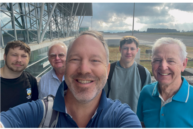
Left: Kilometre zero of the Camino de Santiago at Finisterre, Spain Top: Tired but happy the fivesome gets ready to fly home